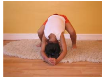
Prasarita Padottanasana C