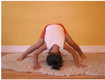
Prasarita Padottanasana A